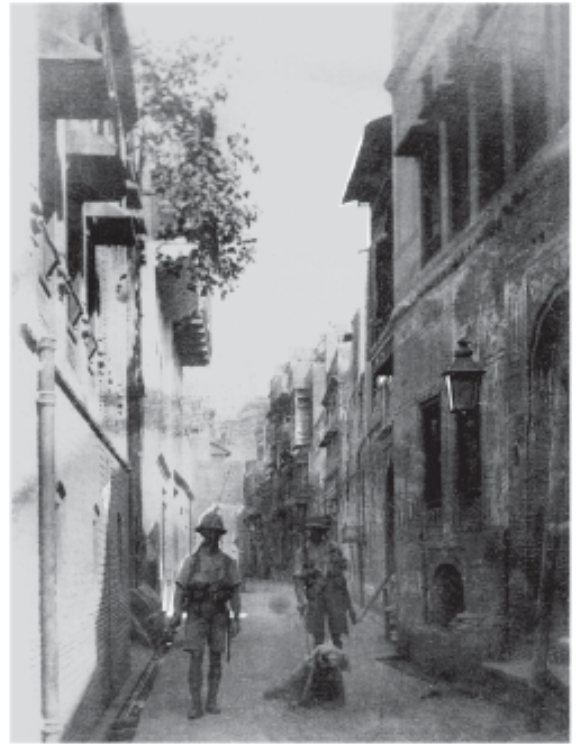
Fig. 3 – General Dyer's 'crawling orders' being administered by British soldiers, Amritsar, Punjab, 1919.

In his famous book Hind Swaraj (1909) Mahatma Gandhi declared that British rule was established in India with the cooperation of