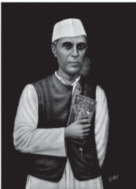
Fig. 13 – Jawaharlal Nehru, a popular print.

Notice that the mother figure here is shown as dispensing learning, food and clothing. The mala in one hand emphasises her ascetic quality. Abanindranath Tagore, like Ravi Varma before him, tried to develop a style of painting that could be seen as truly Indian.