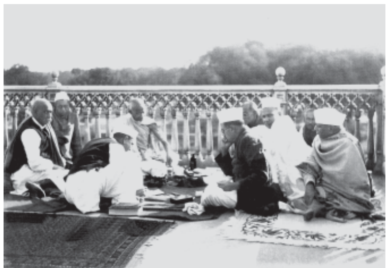
Fig. 6 – Meeting of Congress leaders at Allahabad, 1931. Apart from Mahatma Gandhi, you can see Sardar Vallabhbhai Patel (extreme left), Jawaharlal Nehru (extreme right) and Subhas Chandra Bose (fifth from right).

When the Simon Commission arrived in India in 1928, it was greeted with the slogan 'Go back Simon'. All parties, including the Congress and the Muslim League, participated in the demonstrations. In an effort to win them over, the viceroy, Lord Irwin, announced in October 1929, a vague offer of 'dominion status' for India in an unspecified future, and a Round Table Conference to discuss a future constitution. This did not satisfy the Congress leaders. The radicals within the Congress, led by