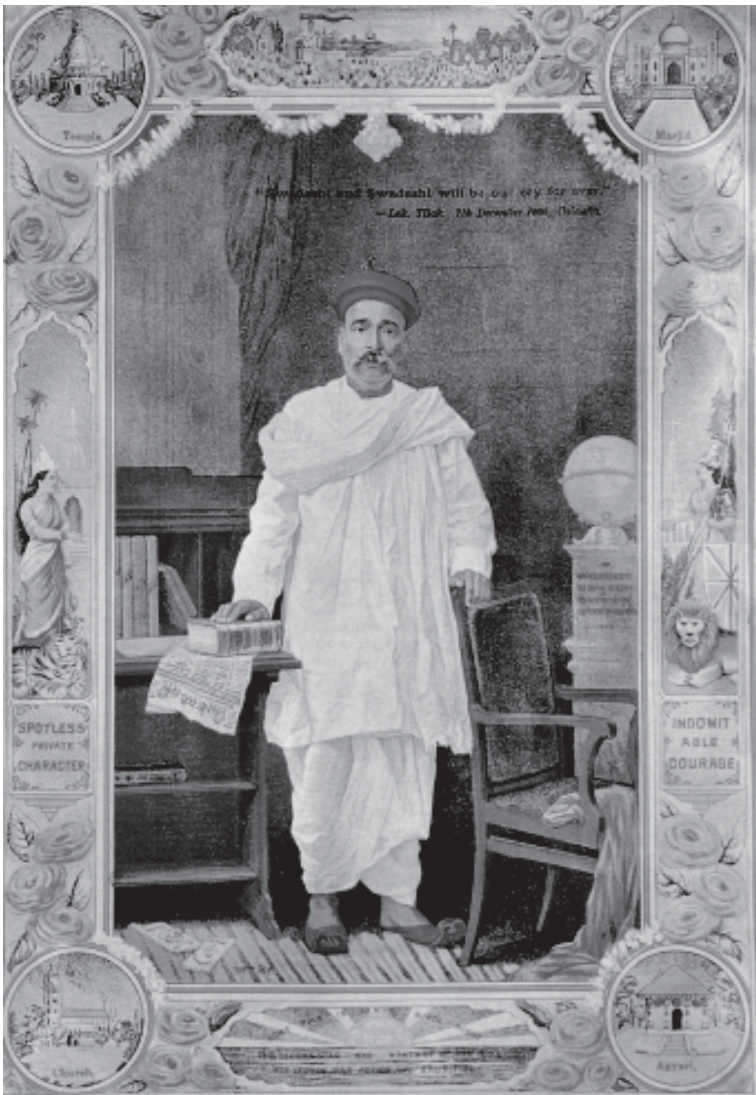
Fig. 11 – Bal Gangadhar Tilak, an early-twentieth-century print. Notice how Tilak is surrounded by symbols of unity. The sacred institutions of different faiths (temple, church, masjid) frame the central figure.

Nationalism spreads when people begin to believe that they are all part of the same nation, when they discover some unity that binds them together. But how did the nation become a reality in the minds of people? How did people belonging to different communities, regions or language groups develop a sense of collective belonging?