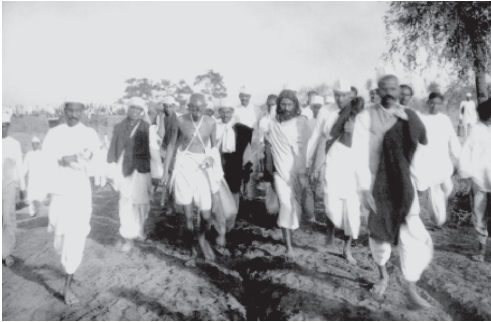
Fig. 7 – The Dandi march. During the salt march Mahatma Gandhi was accompanied by 78 volunteers. On the way they were joined by thousands.

with the British, as they had done in 1921-22, but also to break colonial laws. Thousands in different parts of the country broke the salt law, manufactured salt and demonstrated in front of government salt factories. As the movement spread, foreign cloth was boycotted, and liquor shops were picketed. Peasants refused to pay revenue and chaukidari taxes, village officials resigned, and in many places forest people violated forest laws – going into Reserved Forests to collect wood and graze cattle.