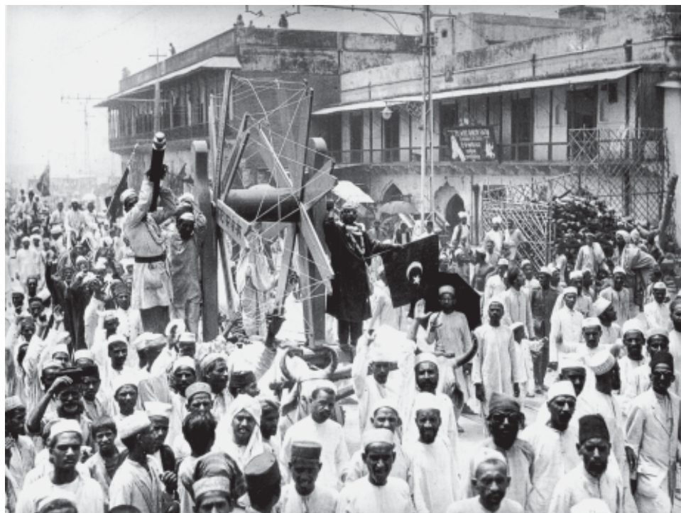
Fig. 4 – The boycott of foreign cloth, July 1922. Foreign cloth was seen as the symbol of Western economic and cultural domination.

Boycott – The refusal to deal and associate with people, or participate in activities, or buy and use things; usually a form of protest