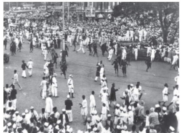
Fig. 8 – Police cracked down on satyagrahis, 1930.

In such a situation, Mahatma Gandhi once again decided to call off the movement and entered into a pact with Irwin on 5 March 1931. By this Gandhi-Irwin Pact, Gandhiji consented to participate in a Round Table Conference (the Congress had boycotted the first