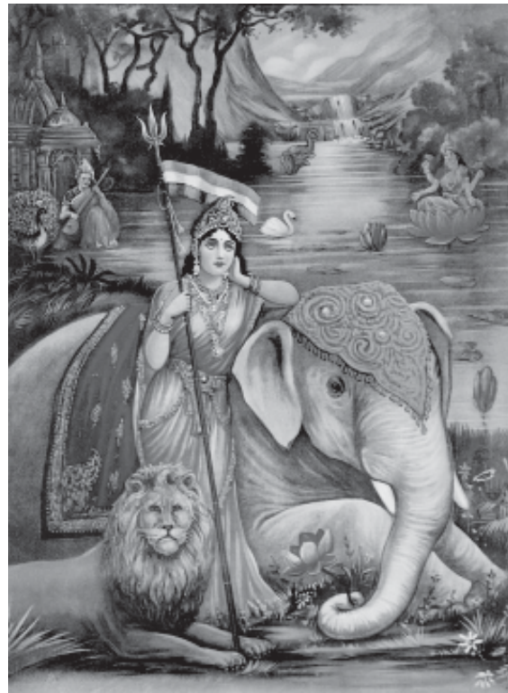
Fig. 14 – Bharat Mata.

This figure of Bharat Mata is a contrast to the one painted by Abanindranath Tagore. Here she is shown with a trishul, standing beside a lion and an elephant – both symbols of power and authority.